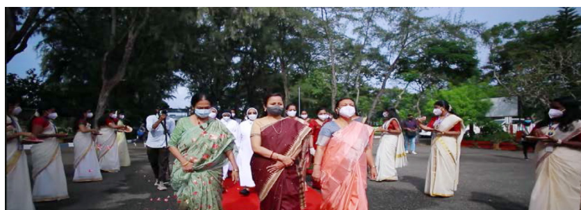
Visit of the NAAC Peer Team

Assessed on its academic, non-academic, infrastructural, social investments, the score testifies to the fact that the institution provides high-quality education, promotes research and innovation, and ensures the overall well being and development of the students. The achievement will definitely serve as a catalyst for its further growth and development, and contributing to its continued success in the years to come.