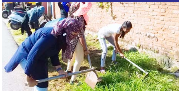
NSS DAY 2019 – COMMUNITY CLEANING DRIVE