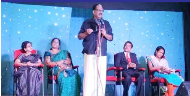
MAGIC SHOW ON LIFESTYLE AWARENESS