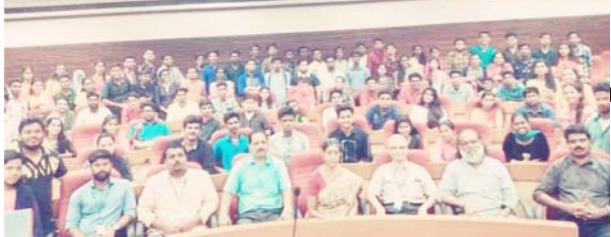
RESIDENTIAL CAMP ON PALLIATIVE CARE