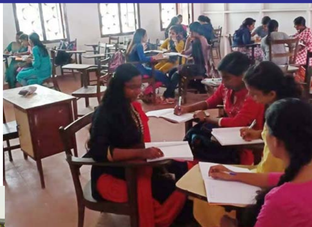
PROJECT GANITHAM TRAINING SECOND PART