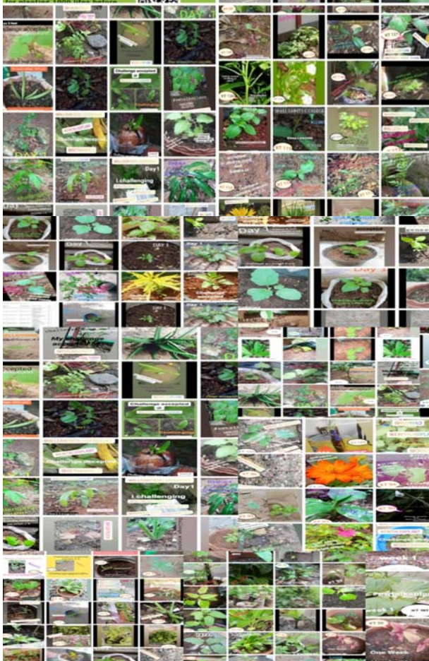
'PLANT A LIFE'