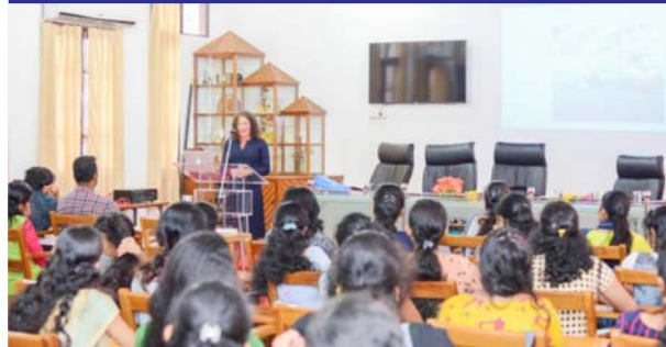
LECTURE ON 'PLASTIC: TIP OF AN ICE BERG?'