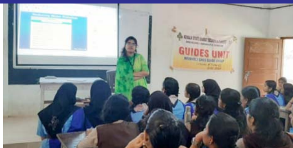
WATER CONSERVATION AWARENESS AT GOVERNMENT HIGHER SECONDARY SCHOOL NEDUVELI