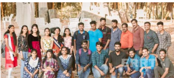
EMERGENCY RAPID RESPONSE TEAM