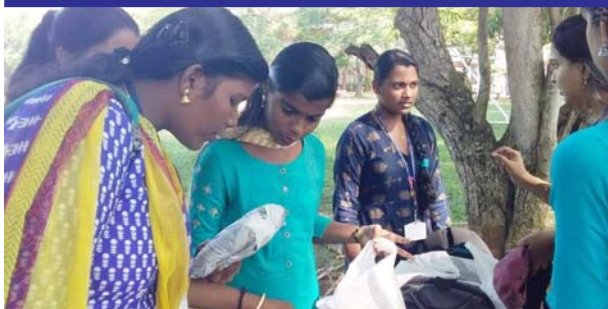
FOOD PACKETS FOR THE BLIND