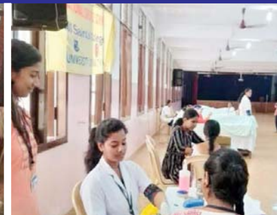
BLOOD DONATION CAMP AT ALL SAINTS' COLLEGE