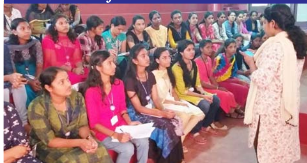
PREAMBLE OF CONSTITUTION