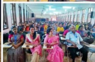
CANCER AWARENESS PROGRAMME BY SUSRUTHA CAN