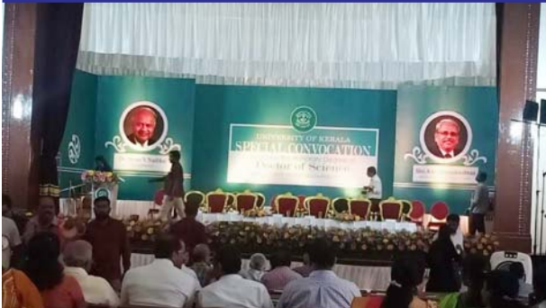
SPECIAL CONVOCATION CEREMONY BY UNIVERSITY OF KERALA