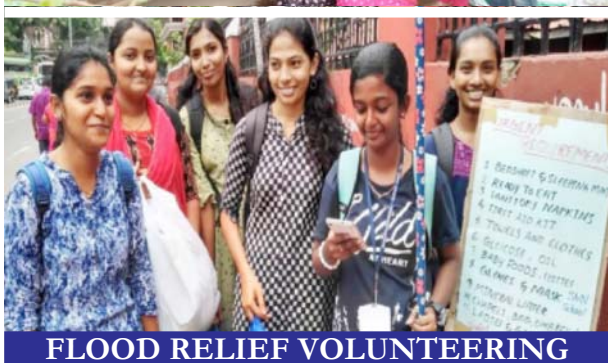
FLOOD RELIEF VOLUNTEERING