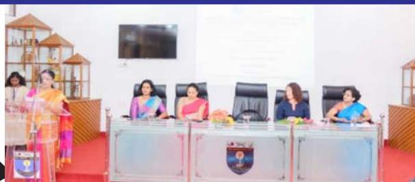
INTERNATIONAL SEMINAR ON MARINE DEBRIS AND POLLUTION