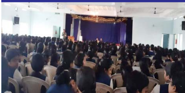
WATER EDUCATION MISSION AT CARMEL GIRLS' HIGHER SECONDARY SCHOOL