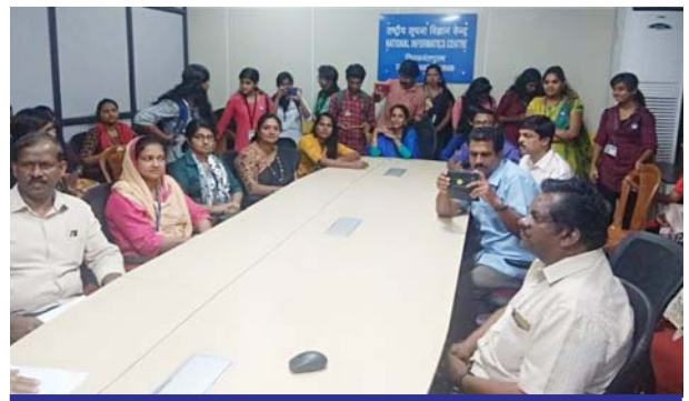
VIDEO CONFERENCE ON FIT INDIA CAMPAIGN