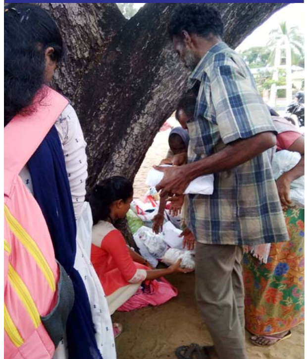
WORLD FOOD DAY