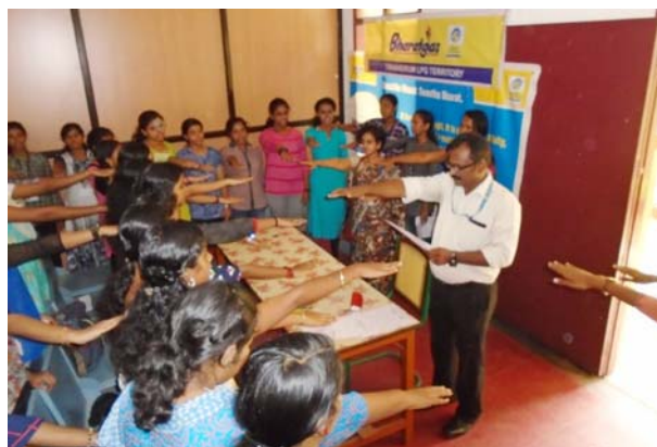
OATH ON SWACHCHATHA