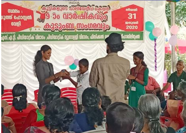
PROGRAMME BY PALLIUM INDIA