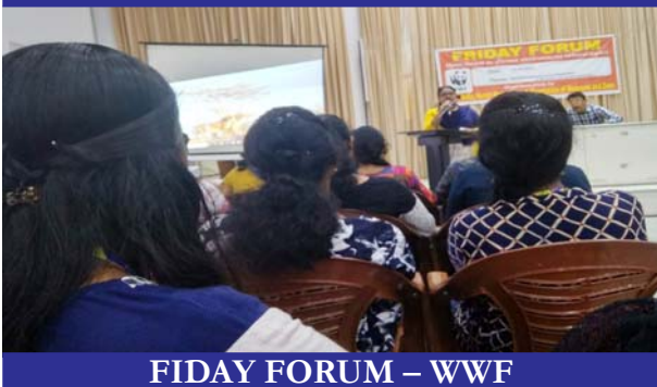
FIDAY FORUM – WWF