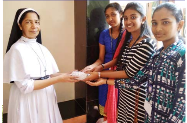
COLLECTION AND DISTRIBUTION OF PACKETS