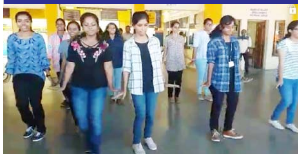
FLASH MOB AT KOCHUVELI