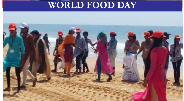
NIRMAL TAT ABHIYAN