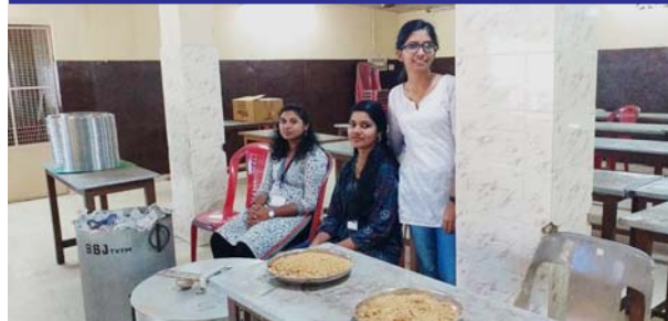
VOLUNTEERING ON REPUBLIC DAY