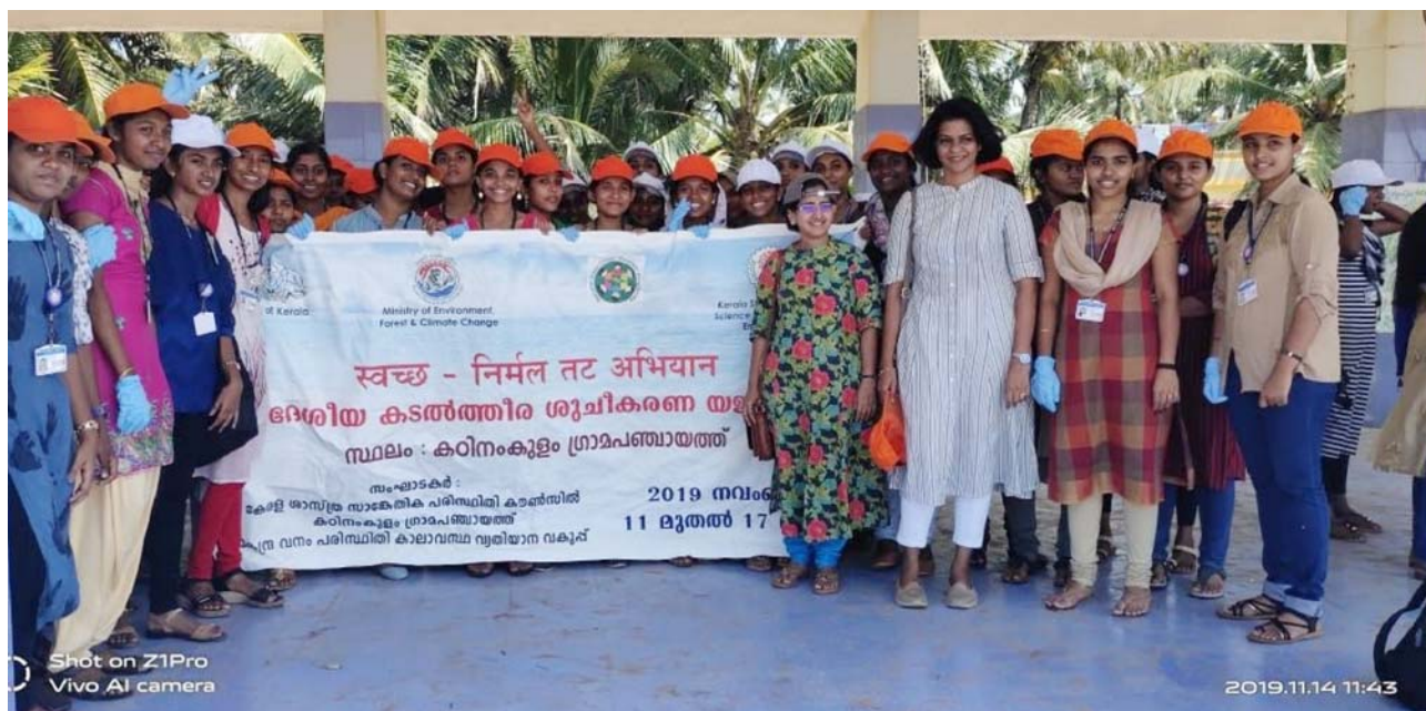
Student volunteers with Institutional Coordinators at Kadinamkulam Beach Cleaning Site