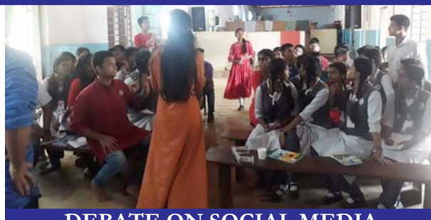
DEBATE ON SOCIAL MEDIA