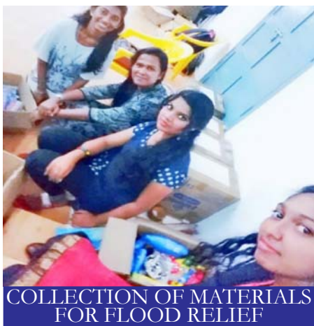
COLLECTION OF MATERIALS FOR FLOOD RELIEF