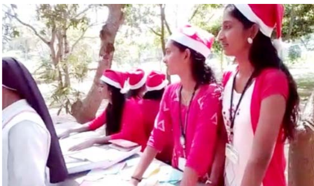
FUND RAISING ACTIVITY