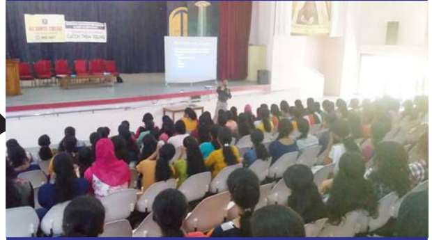
BREAST CANCER AWARENESS