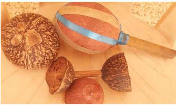
COCONUT DAY OBSERVATION