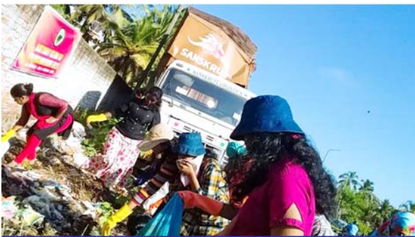
GANDHI JAYANTHI – PROJECT UDYANAM