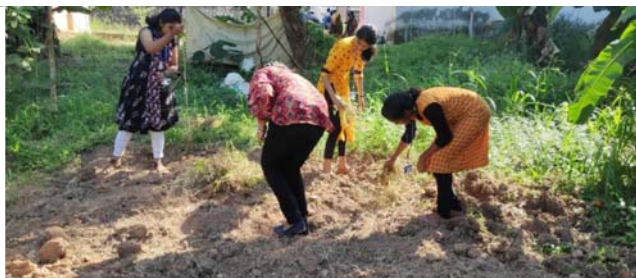
BIRD WATCHING GARDENING PROGRAM