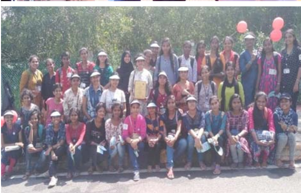
MEGA RUN: WORLD HEART DAY