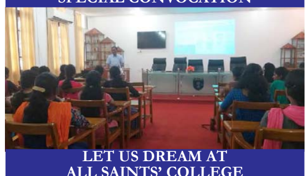
LET US DREAM AT ALL SAINTS' COLLEGE