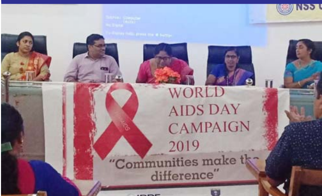
AIDS DAY AWARENESS