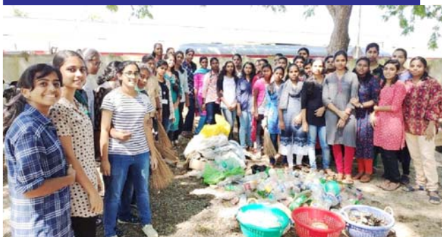
GANDHI JAYANTHI – KOCHUVELI RAILWAY STATION CLEANING