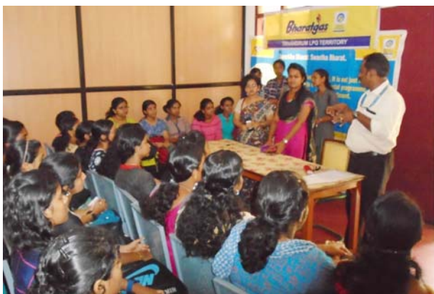
LECTURE ON SWACHCH HI SEWA