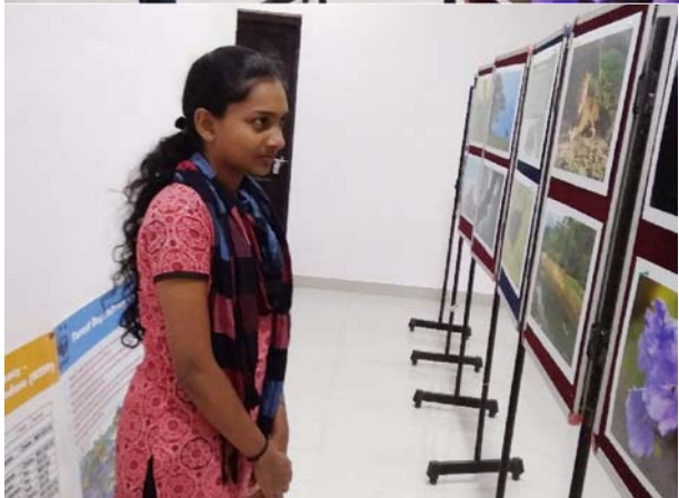
WORLD WILDLIFE WEEK