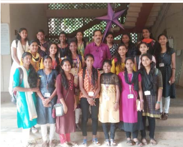
CAPACITY BUILDING ON LIFE SKILLS, DISASTER MANAGEMENT AND FIRST AID