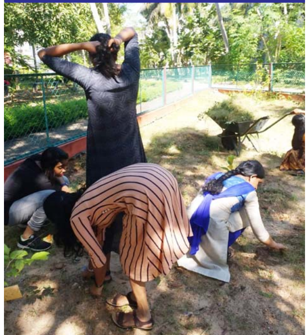
NSS DAY - CAMPUS CLEANING