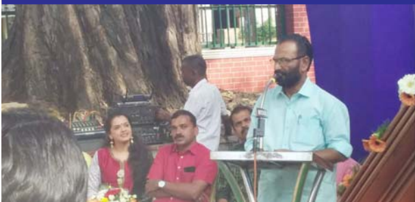
MEETING AS PART OF KERALOLTHSAVAM