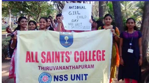
WALKATHON AS PART OF NATIONAL GIRL CHILD DAY