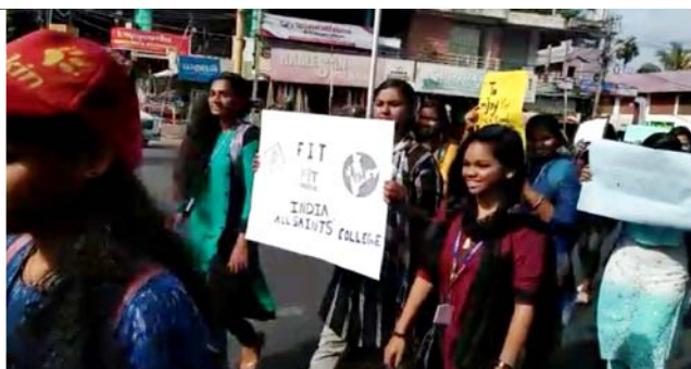
FIT INDIA CAMPAIGN