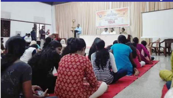
WORLD YOGA DAY