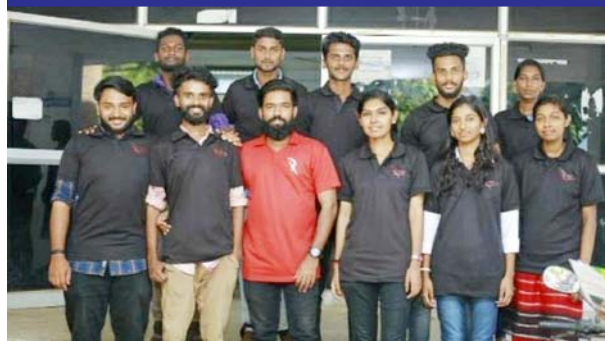
KAS TRAINING PROGRAMME