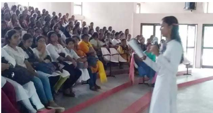
WATER EDUCATION MISSION AT ALL SAINTS' COLLEGE