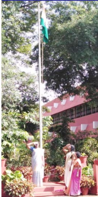
INDEPENDENCE DAY CELEBRATIONS 2019