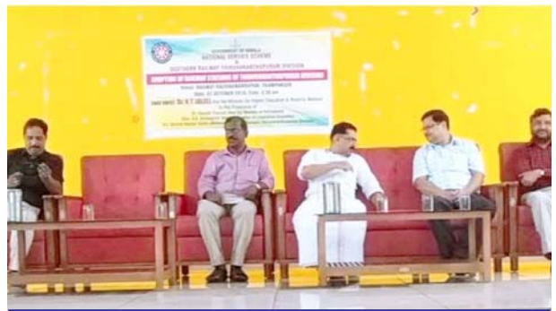
INAUGURATION OF RAILWAY STATION CLEANING