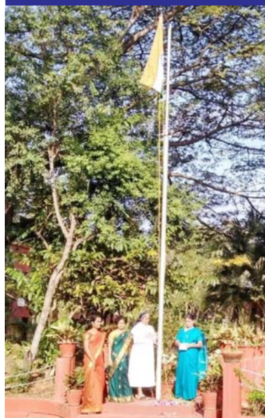
REPUBLIC DAY CELEBRATIONS 2020